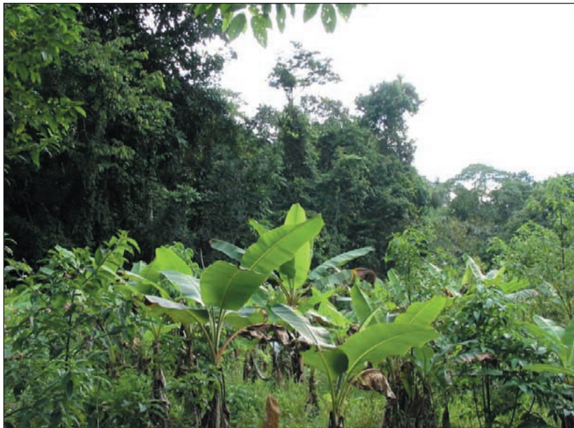
Figure 2. A rainforest fragment adjacent to a farm in rural Costa Rica. Encroaching natural vegetation can influence agricultural production; interchanges between agricultural areas and nearby non-crop areas can be important to both agriculture and conservation.

resent the right kind of biodiversity? While conservation biologists have been focusing on the importance of functional biodiversity rather than “biodiversity for biodiversity’s sake” for years (see Kareiva and Levin 2003), there is still a tendency within agricultural circles to focus on biodiversity strictly in terms of crop production benefits. Recent work on the threat of invasive species illustrates this difference in perspective. For instance, long-term studies documenting beetle species composition following the introduction of the seven spotted ladybird beetle ( Coccinella septempunctata ) have revealed a decline in native ladybird beetle species in temperate areas in the northern US (Elliott et al. 1996). This decline, however, seems to have been offset by a matching overall increase in ladybird beetle abundance (compensated in part by invasive C. septempunctata ), with little loss in predation on aphid prey in agricultural systems. As a result, the invading ladybird beetle has been the subject of little concern for farmers; indeed, C. septempunctata was introduced for the very purpose of controlling aphid pests, and seems to be doing its job. Why should growers be concerned about a slight decline in native biota associated with its introduction?