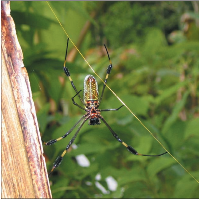
Figure 4. Large amounts of natural vegetation in and around agricultural areas can increase the abundance and diversity of species, such as this orb spider, that are beneficial to agriculture – but are they functionally important in a larger sense?

heavy-input farming to medium-scale farming that incorporates nature-mimicking processes. A transition period will be necessary, during which farmers will rely on the continued use of increasingly selective pesticides and other inputs. The challenge that faces both conservationist biologists and growers is maximizing yields while minimizing environmental impacts.