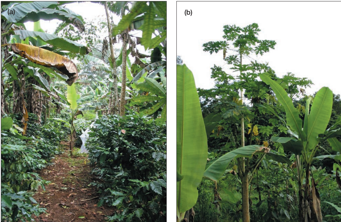
Figure 3. Planned versus unplanned biodiversity: (a) a banana and coffee diculture in western Costa Rica, and (b) a “monoculture” of plantains, with a large number of volunteer plant species. Both planned and unplanned vegetation diversity can play an important role in fostering a diversity of species important both to agriculture and to ecosystem functioning.

(EPA) reevaluate nearly 10 000 specific uses of pesticides, growers still rely heavily on chemical controls to regulate insect pests.