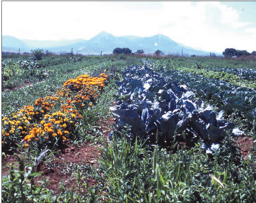
Figure 1. Non-crop deterrents to herbivores and resources for beneficial insects are often incorporated into small commercial farms, such as this organic farm on the western slope of Colorado.

focuses on production food and fiber crops, whereas conservation efforts generally focus on the maintenance of biological diversity. Both of these endeavors require a deep understanding of population dynamics, community ecology, and the effects of spatial scale and disturbance on biotic communities. Fortunately, scientists and practitioners alike have recently been making progress in recognizing these similarities, and have integrated them in creative and innovative ways.